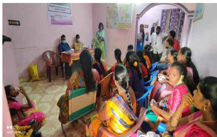
(Skill Development for Voluntary Workers)