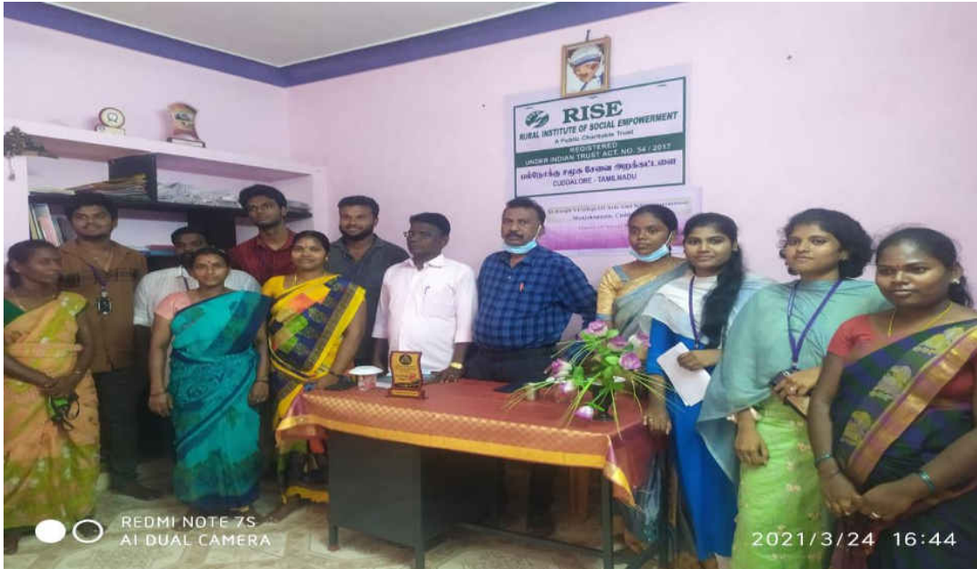
(Students at Programme)