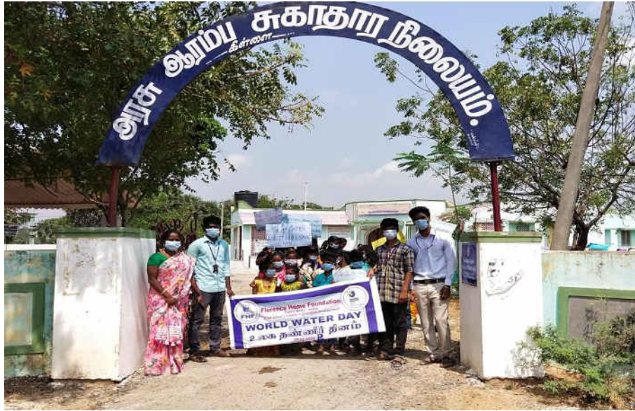
(Students on Awareness Programme)