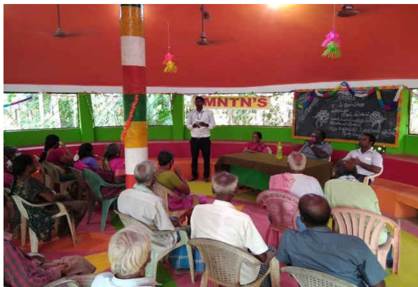
(Chief Guest Address)