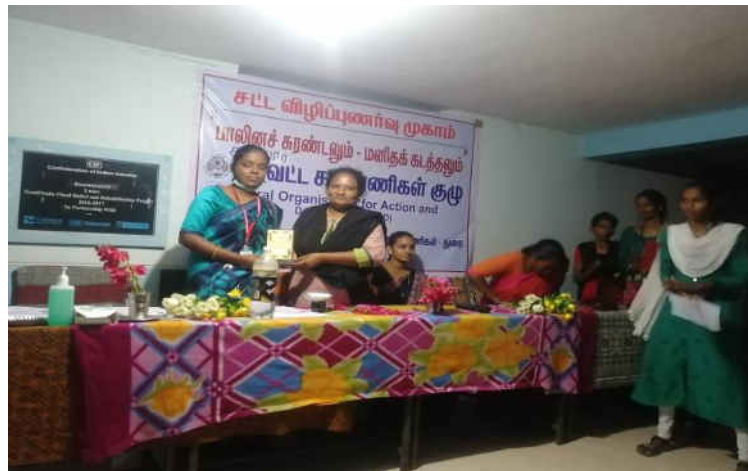
(Honoring Chief Guest)

The social work students organized an Awareness Programme on Sexual Exploitation and Human Trafficking. To create awareness between the children about the adolescence.