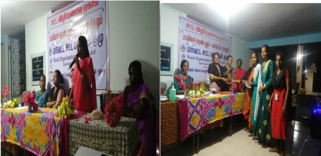
(Chief Guest addressed the gathering)